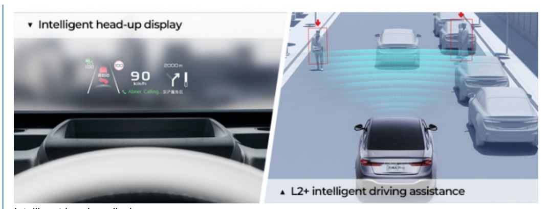
Intelligent head-up display L2+ intelligent driving assistance